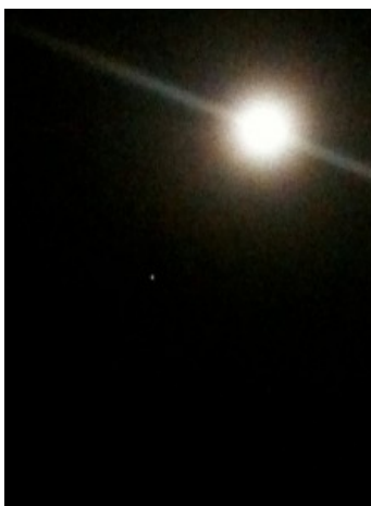
Full Moon Captured with Jupiter

In my own life, the “key” has never ultimately been what I was given, but that which was taken from me as painful as it was! When everything is taken one experiences pain more than once, and it is almost unbearable because one is left to his / her own devices alone and has no “choice as it were,” but to create literally out of nothing in a physical world. Manifestation of success is now simply a MUST. Just like the world was created. Out of no where and no thing! Actually nothing is the “place” from where everything originates. But that very urge to do or die when all is gone, I believe is the key to a lasting fulfillment of the soul, the very “thing” that makes one happy and not just temporarily! It is not another medal, or a title, or a new car, although all of these are really nice to have, but rather it is what you do for yourself and others to fulfill your soul and live up to your full potential. It is simply what we call: creation!