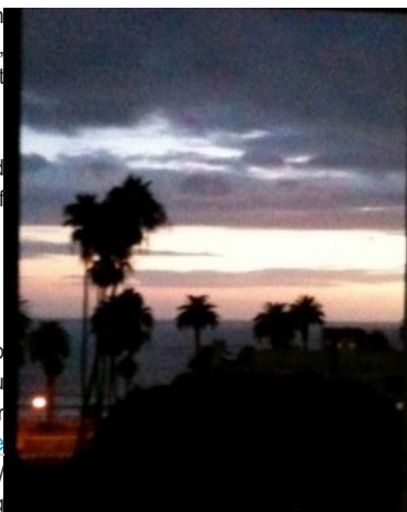
Creation