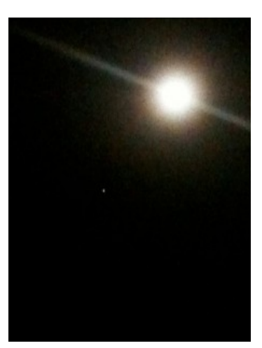
Full Moon Captured with Jupiter

In my own life, the "key" has never ultimately been what I was given, but that which was taken from me as painful as it was! When everything is taken one experiences pain more than once, and it is almost unbearable because one is left to his / her own devices alone and has no "choice as it were," but to create literally out of nothing in a physical world. Manifestation of success is now simply a MUST. Just like the world was created. Out of no where and no thing! Actually nothing is the "place" from where everything originates. But that very urge to do or die when all is gone, I believe is the key to a lasting fulfillment of the soul, the very "thing" that makes one happy and not just temporarily! It is not another medal, or a title, or a new car, although all of these are really nice to have, but rather it is what you do for yourself and others to fulfill your soul and live up to your full potential. It is simply what we call: creation!