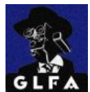
Great Lake F