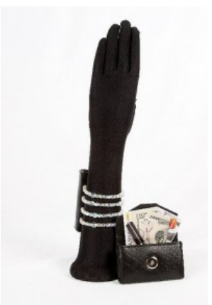
The Brilliant Purseless Purse

Even though others have tried to copy their fashionable designs, no one could come close to creating these extremely practical and very much needed wrist bracelets, which, amazingly enough, are really purses that incorporate both beautiful form and function at the same time. A bracelet becomes a purse! Now, that is something I would call genius besides that it is the latest fashion as well! Its easy to use, and "ready-to-run-with-you" nature is really a novelty, while it is also perfectly engineered to fit your wrist. It poses as an expensive piece of jewelry that one can wear on the red carpet, on a trip, or just run around in town, instead of carrying a purse. Yet, this unique design is indeed a purse that holds your credit cards, ID, and even lipstick. Each strand of crystals and beads are hand beaded and each strand is individually attached to the wallet to insure its safety and security. All designs are created by Deborah Burnett, who made every woman's dream come true and had been featured many times due to her brilliance. No more searching in your purse 24/7, but wearing all that you need on your wrist that is jewelry style, elegant, and a true eye-catcher. Now, this is really an American made item that is most definitely going around the world as the best and one of the smartest products ever created. And, as expensive as it looks, it is affordable! www.canaleoriginals.com