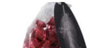
The Most Luscious Wisp of Happiness from Japan: Chocolate!