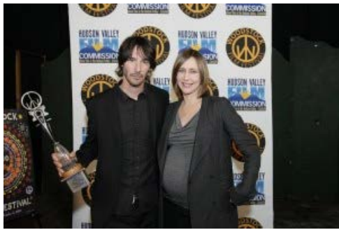
Woodstock Film Festival/ Photo by David Cunningham