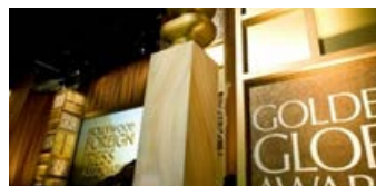
Inside the Golden Globes