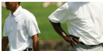
Latest Highlights on the 2010 Lake Tahoe Celeb Golf Event