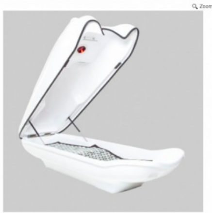
The very popular Infrared Jade Sauna Hollywood is talking about

Once introduced to the Ionized Alkaline Water System , Trish could feel dramatic improvement in her health almost immediately. "It wasn't like these treatments where you have to wait for weeks for results; I felt the positive effects right away," Trish says. She purchased the machine, and over the next 30 days all of her health problems, including fibromyalgia , disappeared completely. "At this time I also started using the Infrared Jade Sauna ," Trish says. "I thought if the water machine had so many benefits then it might enhance when combined with the sauna. When I used both of these treatments I experienced dramatic results. I felt so good and was so relaxed after that first treatment that I wondered how I was going to drive home. These machines do wonders for your circulation and are particularly effective with serious conditions, even breast cancer ."