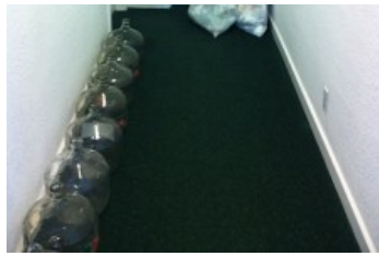
Plastic Waste and Water Delivery that can be replaced with a much healthier, less expensive and more convenient Alkaline Water Machine